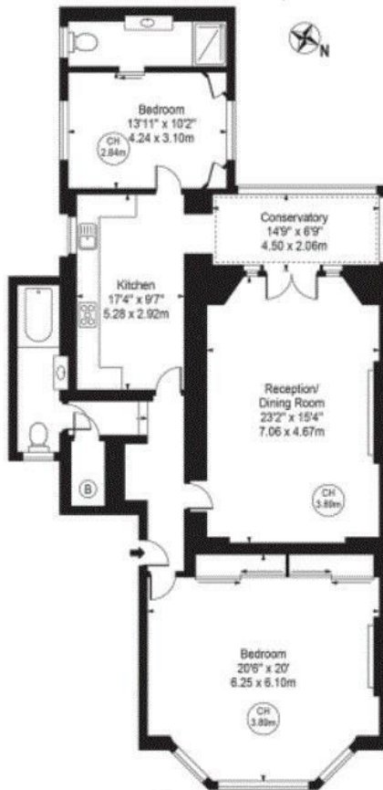
Ground Floor For Illustration Purposes Only - Not To Scale

This floor plan should be used as a general outline for guidance only and does not constitute in whole or in part an offer or contract. Any intending purchaser or lessee should satisfy themselves by inspection, searches, enquiries and full survey as to the correctness of each statement. Any areas, measurements or distances quoted are approximate and should not be used to value a property or be the basis of any sale or let.